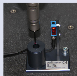
StyliCleaner always Reliable and Clean Stylus