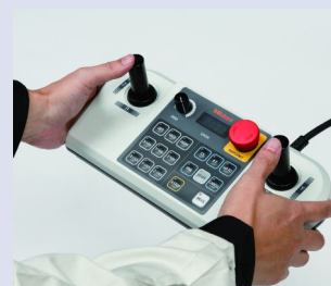
Optional joystick-box M2 with speed adjustment knob